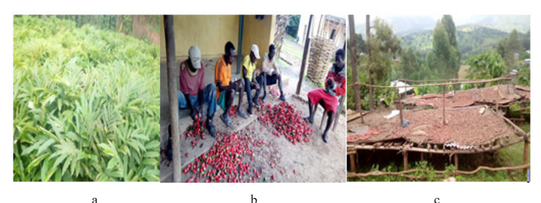
Figure 1. Value-adding activities of Korarima in the study area.