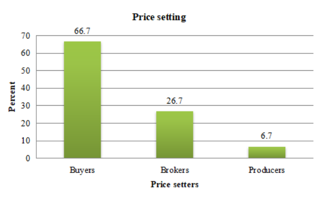
Figure 2. Korarima price setting in the study area.

the study area which has made them price takers. Due to the low price offered by traders in the study area the Korarima producers have been discouraged in the production of this crop. This might have called the concerned body to intervene in such a poor Korarima marketing system in the study area to benefit smallholder Korarima producers. The result indicates that buyers have a great role in setting the price which discouraged the farmers to participate in this business here is the figure that shows the price setting of Korarima.